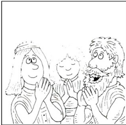
2. Don't worship anything except me.