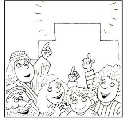
1. I am your God - make me number ONE!