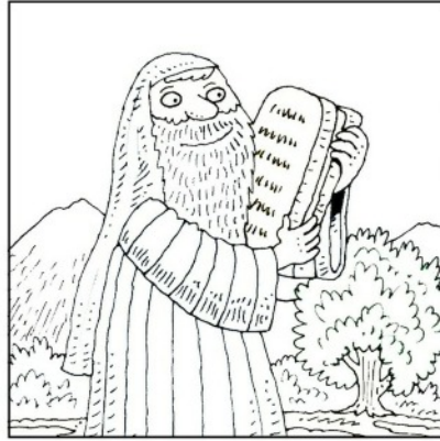
Moses met with God on Mount Sinai and God gave the Israelites ten commandments to help them live well.