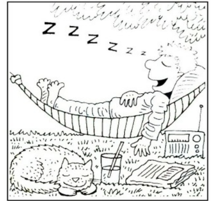
4. Keep one day special each week to rest and worship God.