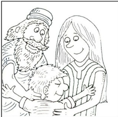
5. Love and respect your parents.