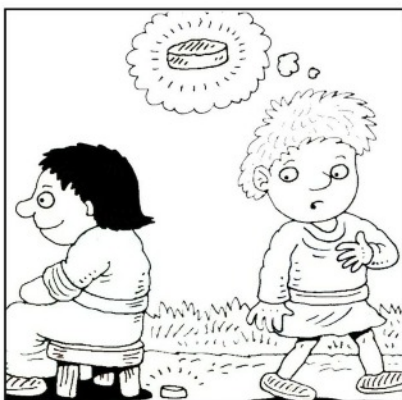
8. Don't take anything that isn't yours.