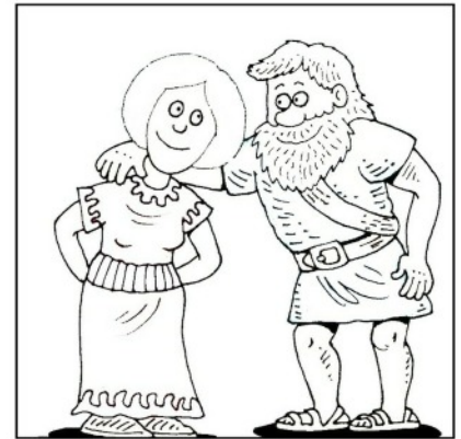
7. Be loyal to the person you marry.