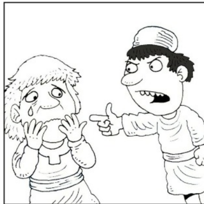
9. Don't tell lies about other people.