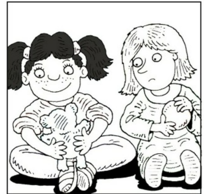
10. Don't be jealous of what other people have.